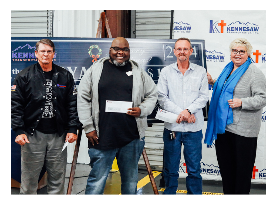
COMPANY CULTURE CHRISTMAS OPEN HOUSE