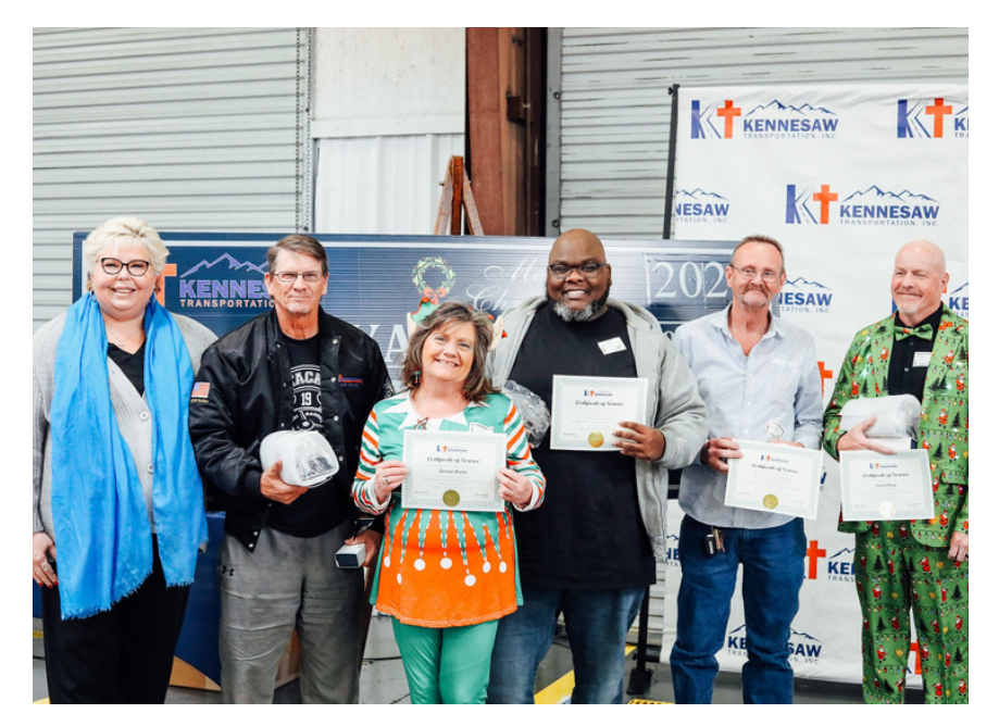
COMPANY CULTURE CHRISTMAS OPEN HOUSE