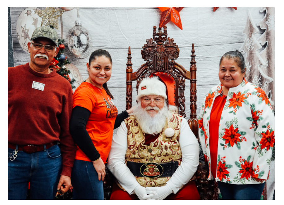
COMPANY CULTURE CHRISTMAS OPEN HOUSE